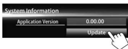
(fig3) Push Update to start the update