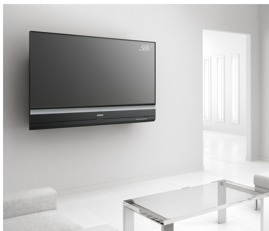
Image of Installed Projection TV Prototype Equipped with “Slim Optical Engine”

JVC will display a prototype 58-inch slim full HD projection TV featuring this technology and using JVC's own D-ILA reflective LCD technology in the optical engine in the JVC booth at CEATEC Japan 2006 to be held at the Japan Convention Center at Makuhari Messe from Tuesday to Saturday October 3-7.