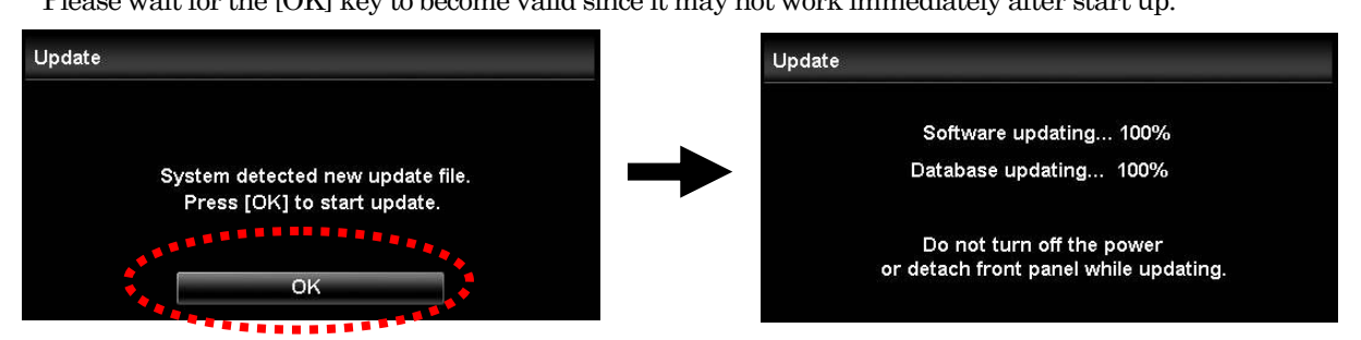
NOTE: Do not detach the front panel or turn off the power during update.

1. When the system starts up, the following screen will appear. Press [OK] to start update. * Please wait for the [OK] key to become valid since it may not work immediately after start up.