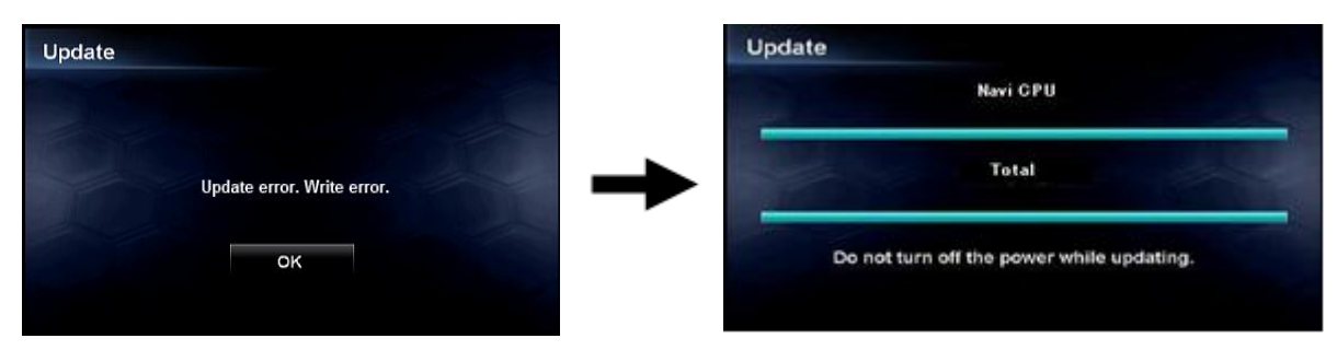
Note - If the update error screen will appear, press [OK].

3. Progress of the update will be displayed during the update process.