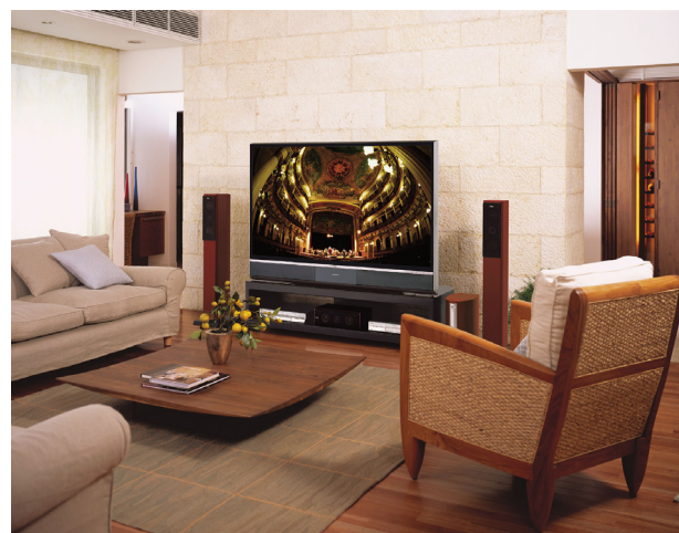
Installation Image of 70-inch model in a living room